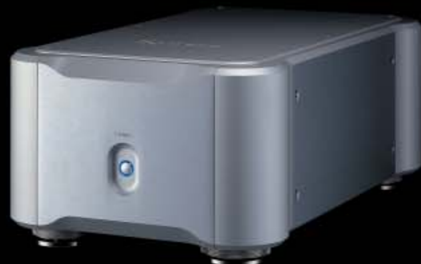
P-01 Power Supply Unit