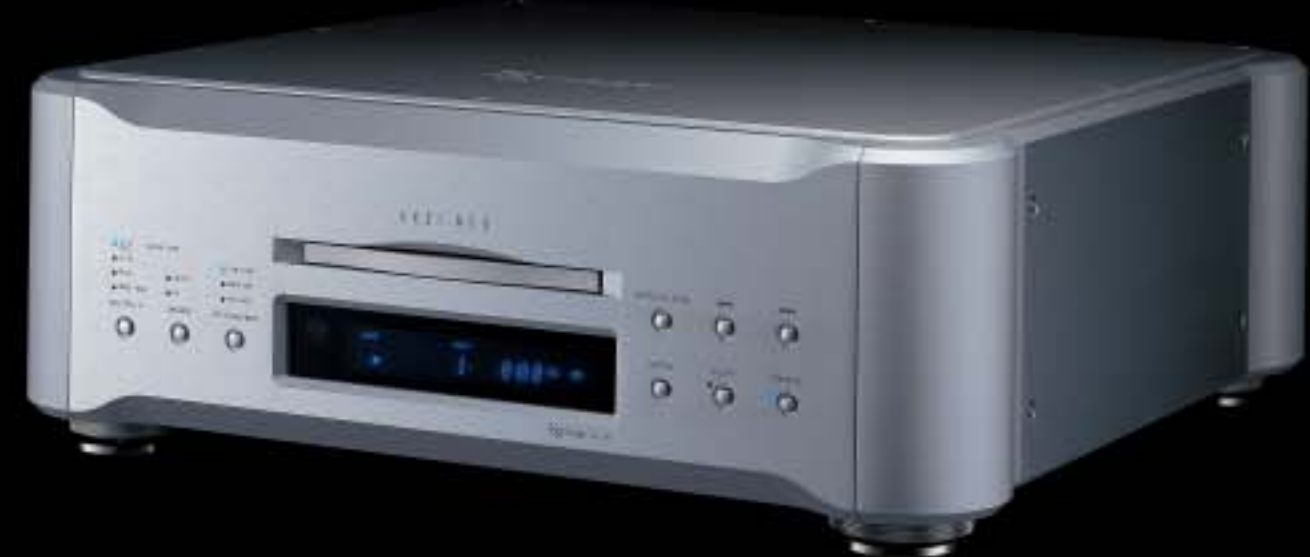
P-01 Main Unit