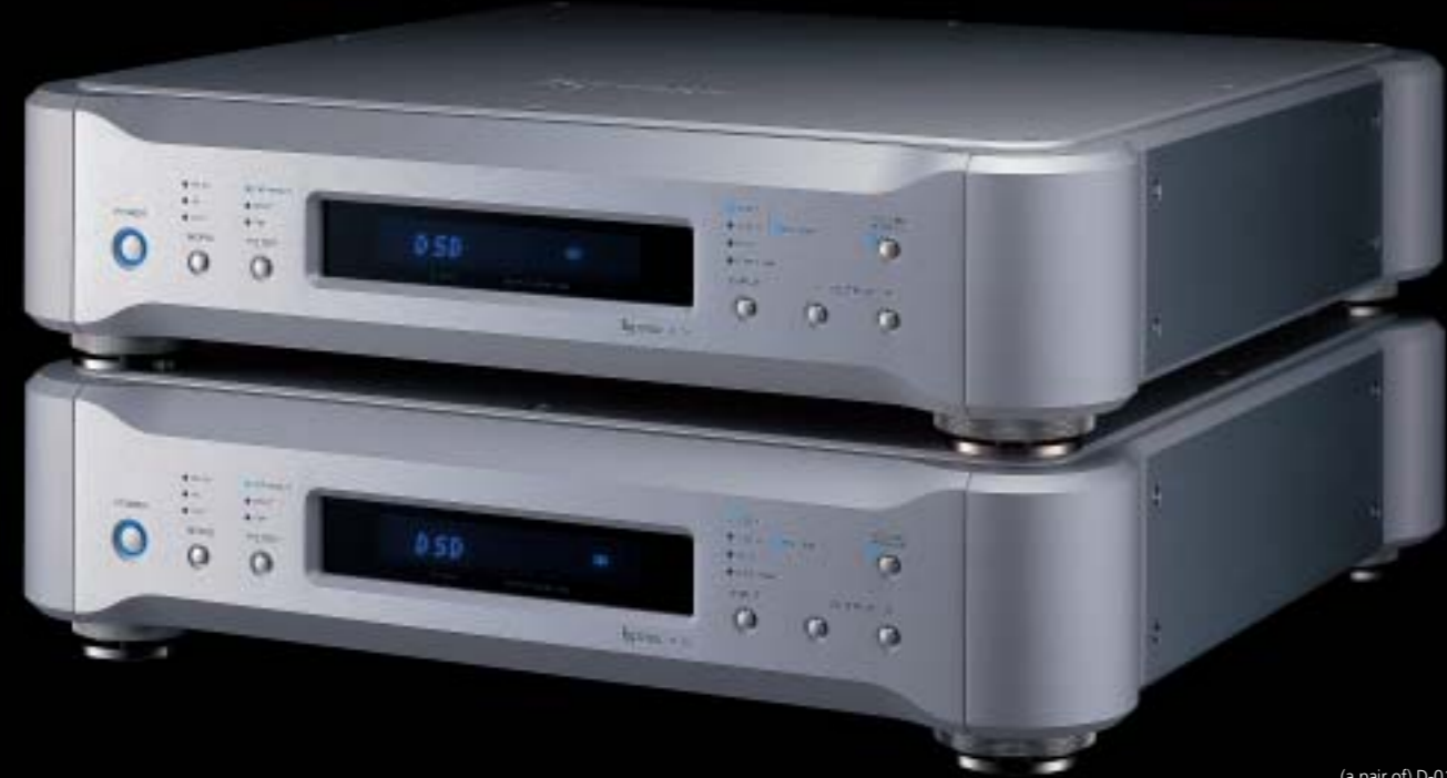
(a pair of) D-01

designed to realize the full potential of the SACD format