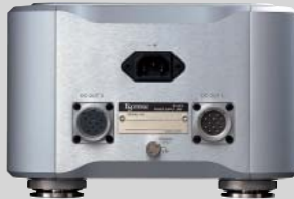
Power Supply Unit